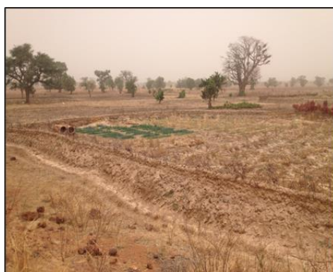
An onion garden in Lawra dry lands

The development of national level policy frameworks for adaptation planning is proceeding well in both Mali and Ghana. These national policies provide general guidance for investments and actions aimed at addressing adaptation needs. However, there are a lack of effective mechanisms, financial resources, and institutional capacities in place to effectively implement adaptation frameworks. Climate finance mechanisms are increasing in Ghana and Mali, which can help to mobilize resources for adaptation, however these mechanisms do not effectively engage the private sector.