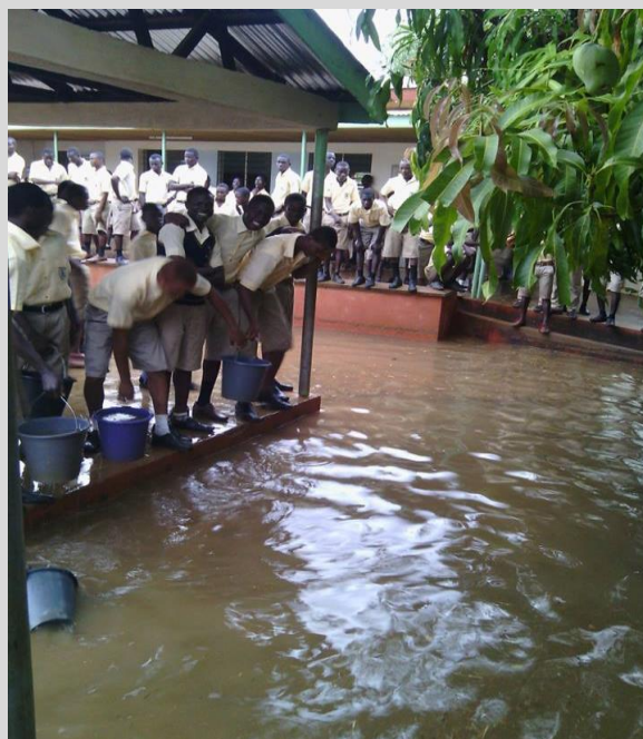
Students collecting floodwater

Decentralization of governance authority over natural resources management, while having potential to better address local management needs, has thus far largely not been successful as local governments are ill equipped to assume responsibilities over natural resource management. This lapse in governance brought on by decentralization has been attributed to an increase in degradation of forests and rangelands, which in turn increase vulnerability to drought. Reduced access to pastoral corridors and other changes underway in pastoralism across semi-arid West Africa exemplify how climate and non-climate drivers intersect to enhance vulnerability. Herder-farmer conflict in West Africa has increased as northern pastoralists have extended further southwards into regions dominated by crop agriculture, while at the same time farmers have expanded crop production into lands used primarily by pastoralists.