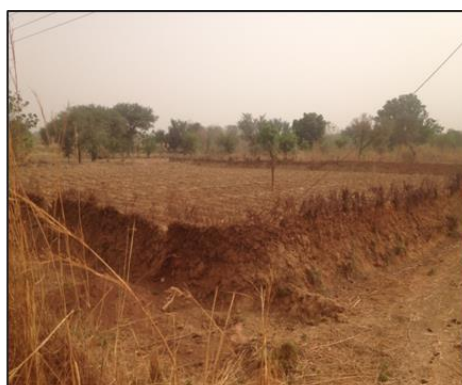
Mud used to retain water in cultivated land in Lawra