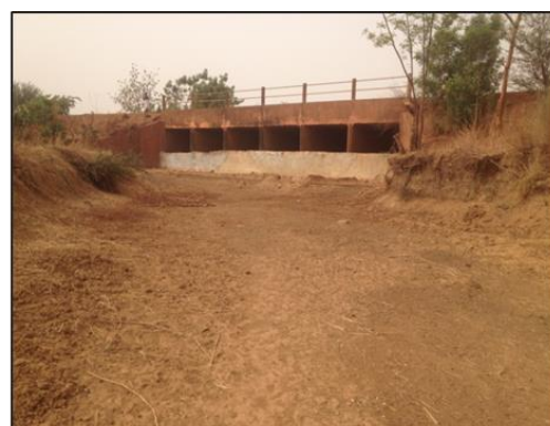
A wall built under a bridge in Lawra to retain water