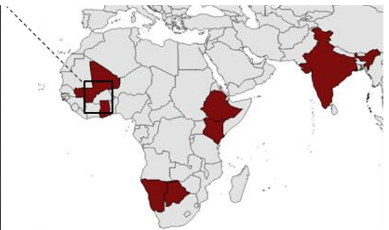
DRYLAND STUDY AREAS OF WEST AFRICA