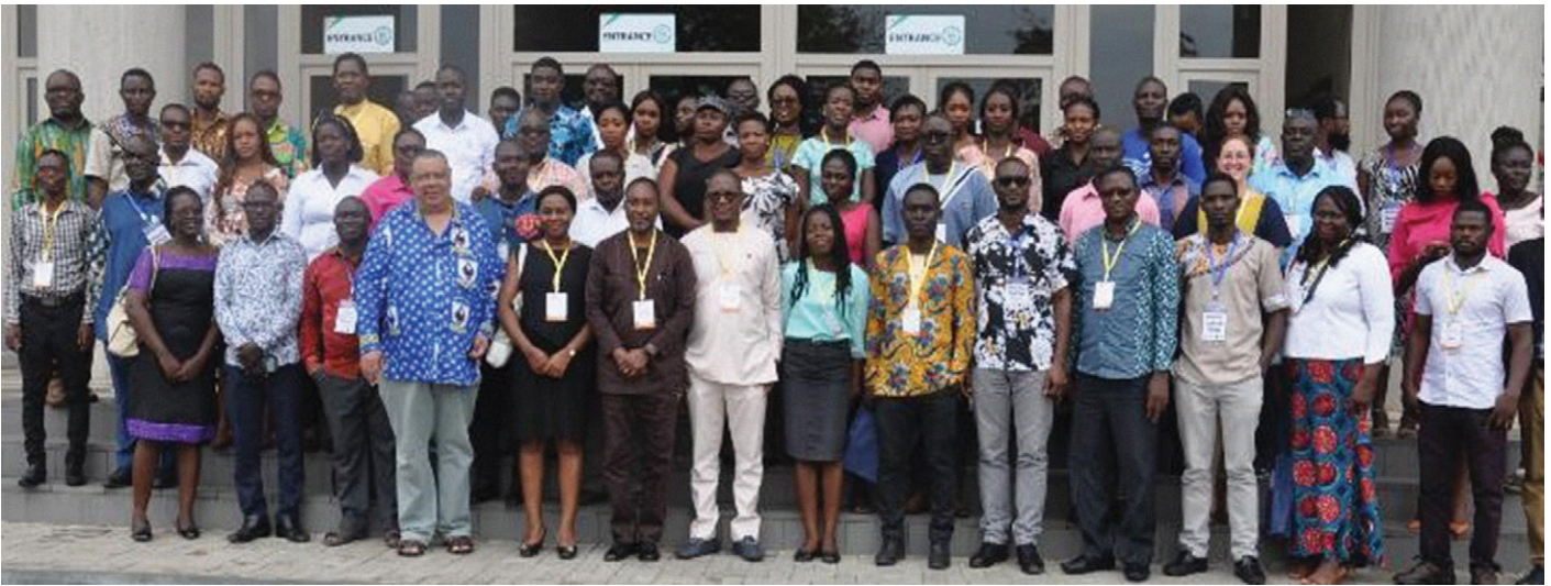
Participants of the event on ecosystem-based disaster risk reduction of floods: Policy response strategies for Ghana, held at the Accra Metropolitan Authority as part of CCPOP 7 Conference, November 2019.

imported non-invasive plant which is used in Ghana for the various purposes mentioned above. 4