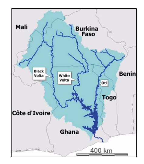
Fig. 1. Map of the Volta Basin

The results indicate that an unusual rainfall receipt in 2010 was the major cause of the flooding in the basin. Other predisposing factors included: